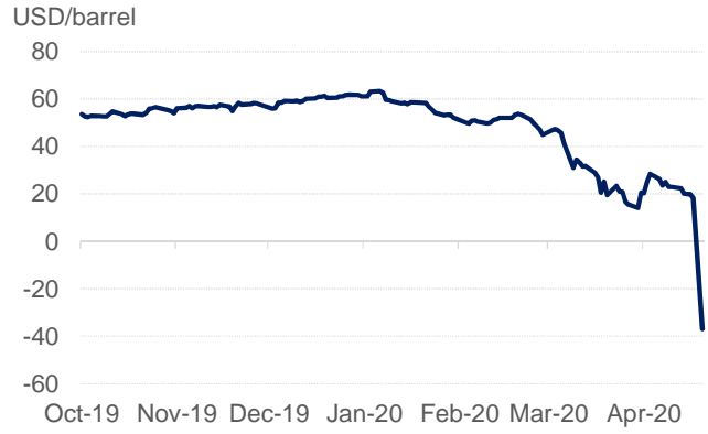
Chart 2: WTI Crude Oil Price