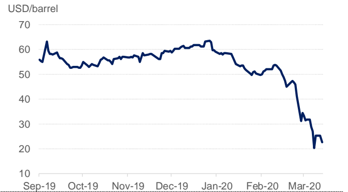
Chart 2: WTI Crude Oil Price